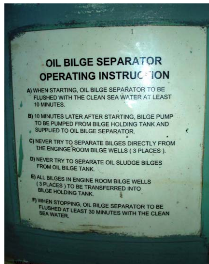
Clear to read

Manager's instructions and service manuals concerning the OWS and related equipment should be maintained on the ship. It is mandatory that proper