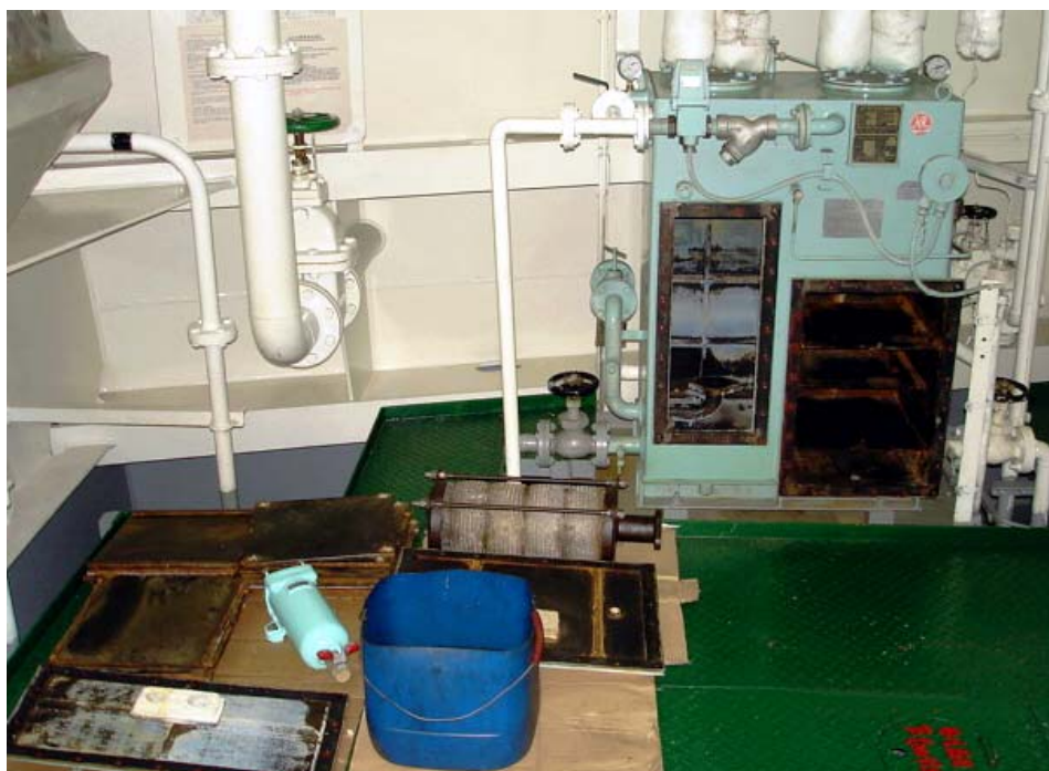
OWS opened for maintenance