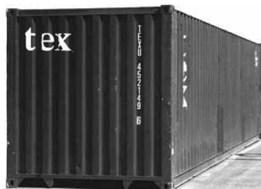
Marking on the front end of a container

This Figure shows a version of vertical container marking.