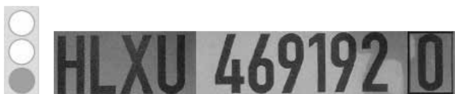
Correct identification using check digit 0