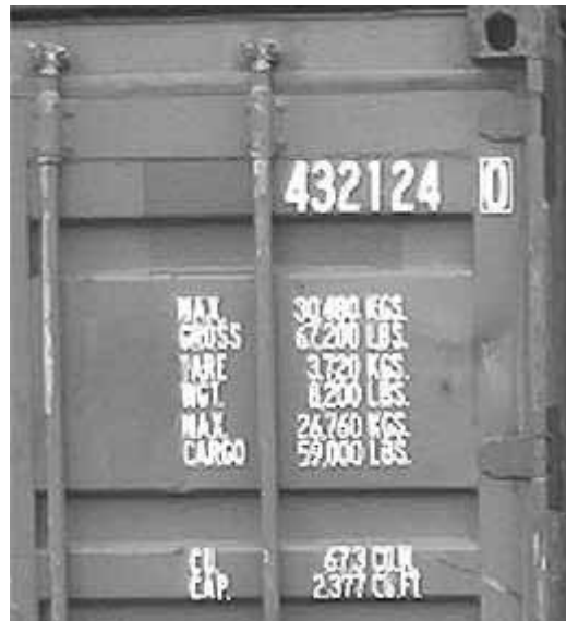
Alpha prefix absent

If the owner code is absent, the container cannot be identified.