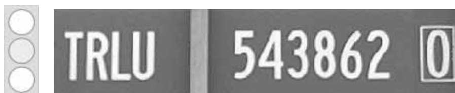
Disadvantage of check digit 0

Since the correct check digit for this container is 6, the system would indicate an error.